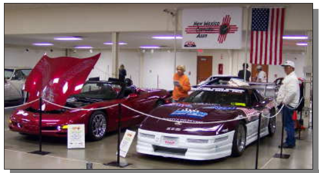
2005 Super Nationals

Also block Sunday May 20, 2007 for the annual Albuquerque Museum Show.