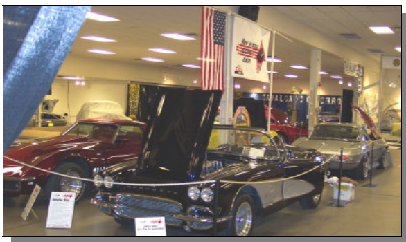
2006 Super Nationals

Each year for the past several years NMCA has been afforded space enough for 5 Corvettes to be displayed during this well attended automotive event. The time is upon us now to form a committee charged with this display. NMCA, in the past, has paid the entry fee for the 5 Corvettes. But because we tend to decide things last second, the display is pretty dull. Following last years event it was agreed that NMCA would purchase new stanchions and move into the 90's....we're still in the late 60's with the old stanchions. More importantly, a theme needs to be developed and a little sparkle put on our display. NMCA could easily win first place for club display, but not by simply showing up and roping off 5 Corvettes. Anyone who has attended this event will tell you that there are a number of ways to dress our display to be at least on par with the other guys. NMCA should seriously consider taking action now to secure the committee, who will then decide the theme, and will then locate the Corvettes to fit that theme, then build the elements needed. Or, we can put 5 cars in much like a parking lot and have the club out $175. The choice rests with the members.