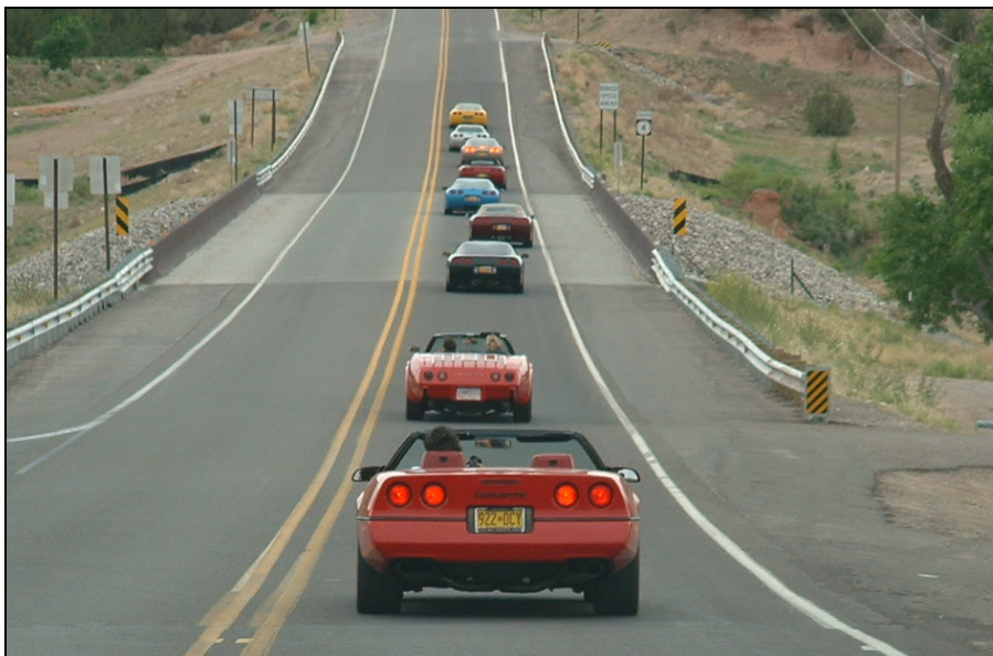
May 23 rd caravan through Jemez mountains