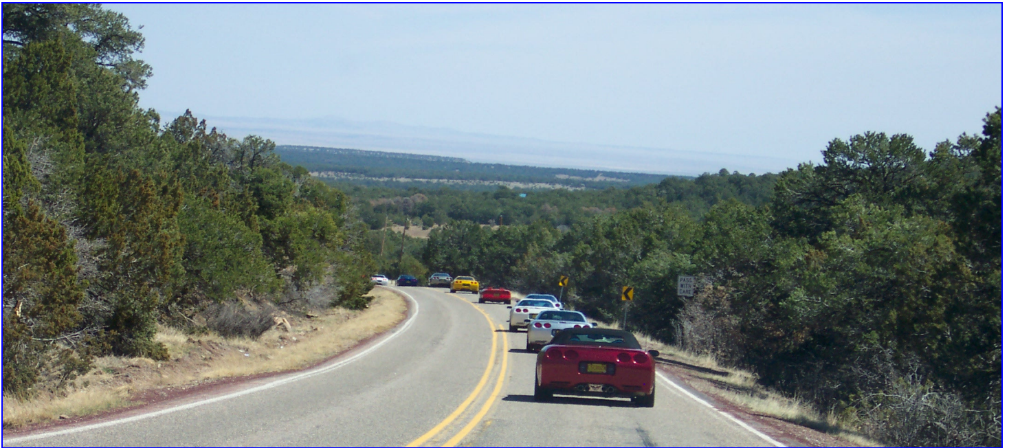
(March 21 st NMCA caravan to Mountainair, NM)

Navigating the NMCA web site is simple, but to get the most, here's another tip to assist you with your journey. On the left side of the screen under the index area you'll find a list of up-coming events. By clicking on an event you'll be directed to the page with additional details about that particular event. However, please note that the listing on the left side of the screen only lists NMCA and NCCC events contained in the calendar. Many more events and listings can be viewed by going straight to the calendar itself. Click on "Events" or "Calendar" within the main index to get to the calendar. Search by month, and then click on the topic or header of interest. With so many events listed, it would be too confusing to have each event show up on the left side index bar on the home page. Check it out and see for yourself. Again, the primary events that involve NMCA and/or NCCC will be highlighted to bring added attention to the event. You are encouraged to stay abreast of all events by visiting the web calendar area from time to time. If you know of an event of interest to our members, please forward all details to info@nmcorvette.org for inclusion on the calendar.